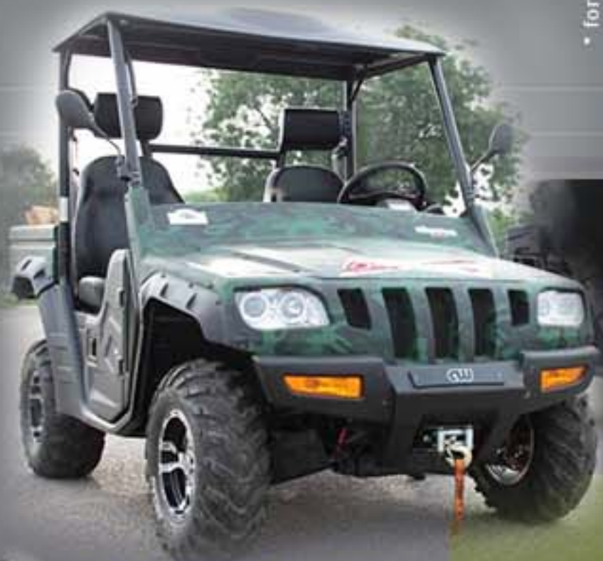
300 Ltrs Loading Bay